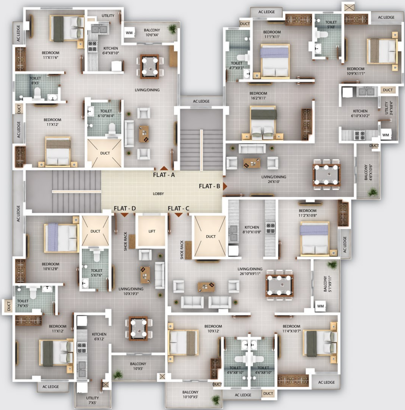
TYPICAL 1ST TO 5TH FLOOR