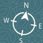
SITE PLAN WITH GROUND FLOOR