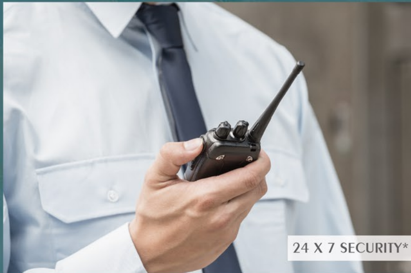
24 X 7 SECURITY*